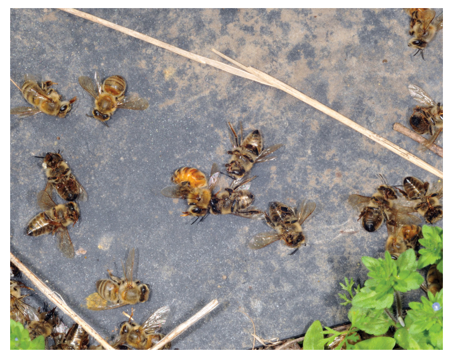
Figure 10. The sudden appearance of dead bees outside of hives is often a sign of pesticide poisoning.