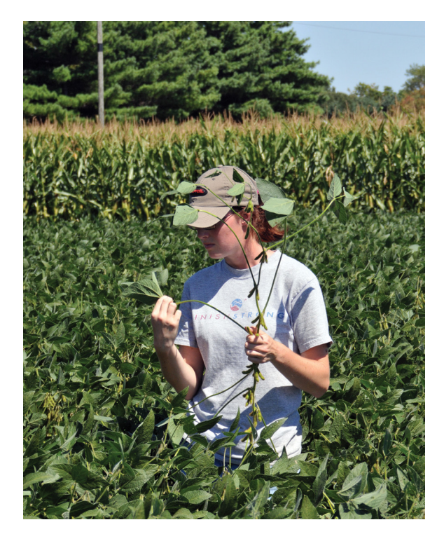
Figure 8. Scouting fields helps determine whether insect pest populations are at a level that warrant treatment.

For example, while soybean aphids are present in many fields each year, they usually do not reach economically damaging thresholds, so insecticide applications are often unnecessary. For a more detailed discussion of neonicotinoids and their effectiveness against soybean aphid, see The Effectiveness of Neonicotinoid Seed Treatments in Soybean (Purdue Extension publication E-268-W), available from the Education Store, www.edustore.purdue.edu.