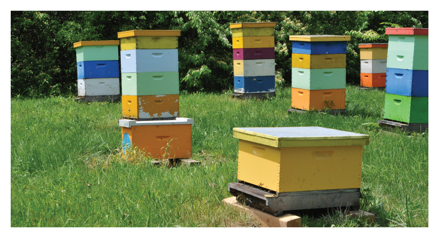
Figure 11. Hives in an apiary

All illustrations by Purdue Extension.