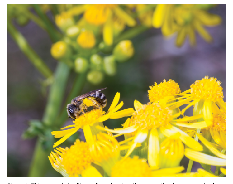
Figure 3. This ground-dwelling solitary bee is collecting pollen from a cressleaf groundsel flower.

If you apply foliar insecticides to corn and soybeans, it is often when the crop is flowering. These applications will likely kill pollinators that visit during the application or shortly after it. When pesticides associated with field crop production kill pollinators, it is often because they were directly exposed to the pesticide or the product drifted onto flowers that the bees were foraging on.