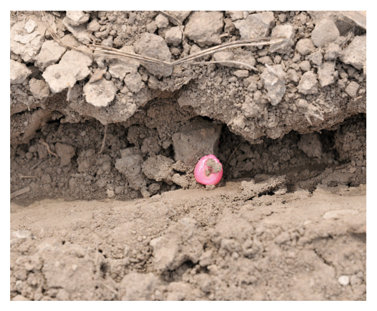
Figure 9. The insecticide coated on this corn seed is intended to help protect the seed from occasional soil pests; however, it can have the unintended effect of harming pollinators.

Currently, there is little market demand for untreated seeds. As a result, growers seeking elite varieties often don't have the option of ordering untreated seed. However, if growers request these options regularly, vendors will respond. Untreated seed has the additional benefit of reducing costs associated with insecticide.