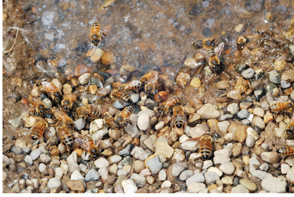
Figure 5. Honey bees drinking stagnant water next to a field.

Pesticide-contaminated surface water sources are also a source for exposure. Bees seem to favor the still water of ponds, wheel ruts, and mud puddles for their drinking water. Investigators are still trying to determine whether the compounds in these water sources are harmful to bees at a lethal or sub-lethal level.