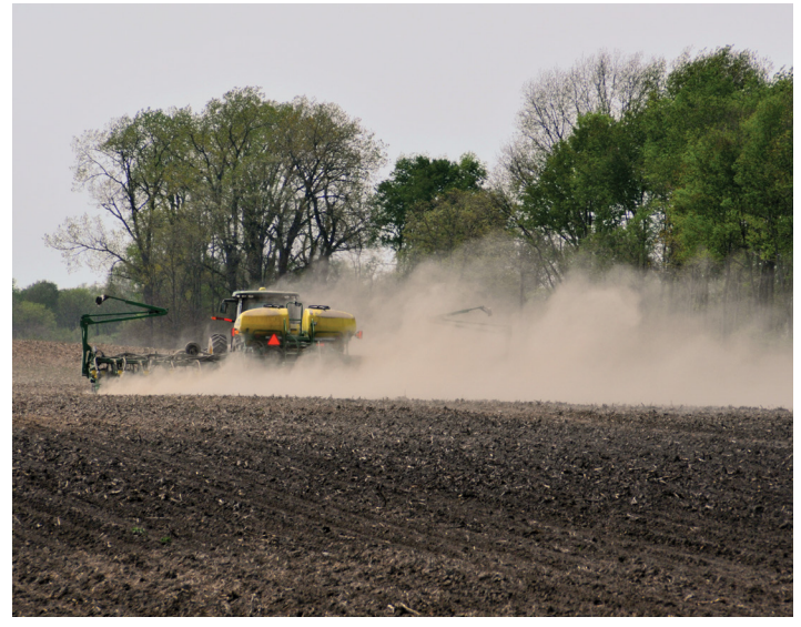
Figure 4. Insecticide that rubs off neonicotinoid-treated seeds during planting can come into contact with pollinators in or around this field.

What's more, honey bees become statically charged during flight and any dust they encounter during flight will adhere to their bodies. The pollen produced by corn plants that were grown from seed treated with a neonicotinoid insecticide will often have residues that are toxic to pollinators.