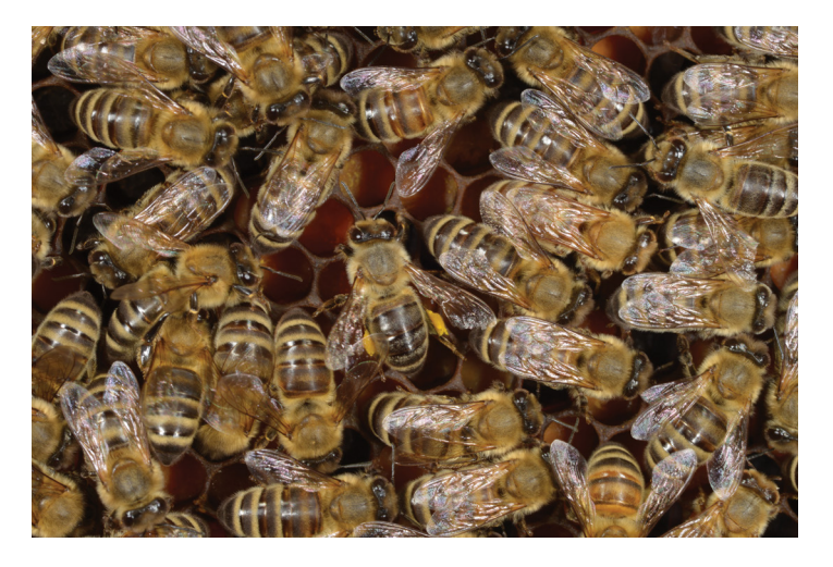
Figure 1. The close quarters of a honey bee hive make it easy to spread diseases, mites, pesticides, or other stressors.

Even if a pesticide doesn't kill, a sub-lethal dose may reduce the pollinator's ability to perform routine tasks, or to orient to pollen, nectar sources, and the colony.