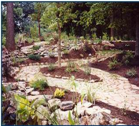
Changing your landscaping away from mowed turf grass can help deter geese.

Remember, solving the problem begins with you. You must adopt an integrated and persistent approach that includes a no-feeding policy, habitat modification, harassment, and where possible hunting.